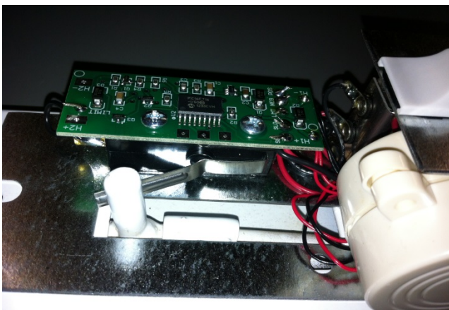
Left Hinged Door Locked Position